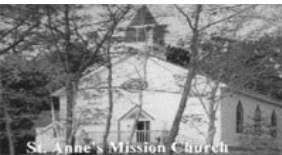
St. Anne's Mission Church