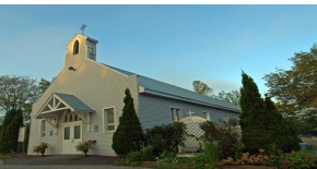
St. James the Great

St. James the Great (MacTier) 509 High St. Sunday 11:00 am