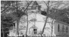
St. Anne's Mission Church

WEEKDAY MASSES: as scheduled inside. SACRAMENT OF BAPTISM: Please contact the Parish Priest or call the office. SACRAMENT OF MARRIAGE: by appointment, one year or at least six months in advance. SACRAMENT OF RECONCILIATION: 30 minutes before all weekend Masses or by appt.