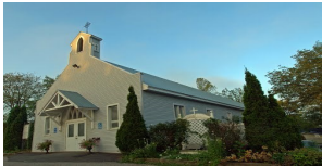
St. James the Great